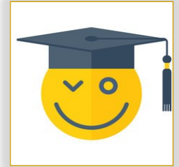
Learning with Laughter! :)